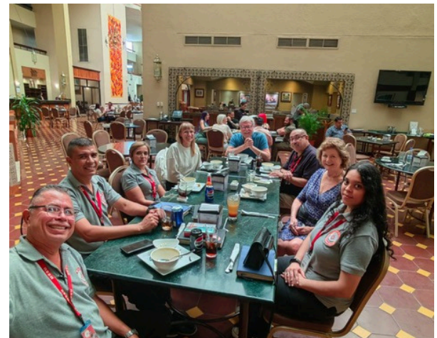
Discussing ideas for the future of Siempre Unidos

One patient shared: “Coming here to Siempre Unidos is like having another family. I didn’t have anywhere to go, but here they gave me a home.”