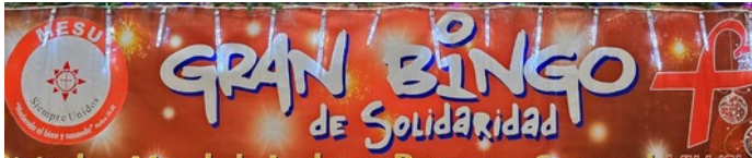
Raising funds through our very popular Solidarity Bingo

We are extremely proud to share with you that the Honduras team raised an incredible $21,000 USD in 2024 . This fundraising is outside of the financials below. The staff in Honduras prioritized using these funds to purchase a new hematology analyzer for the laboratory, seven computers, a multimedia projector, and speakers.