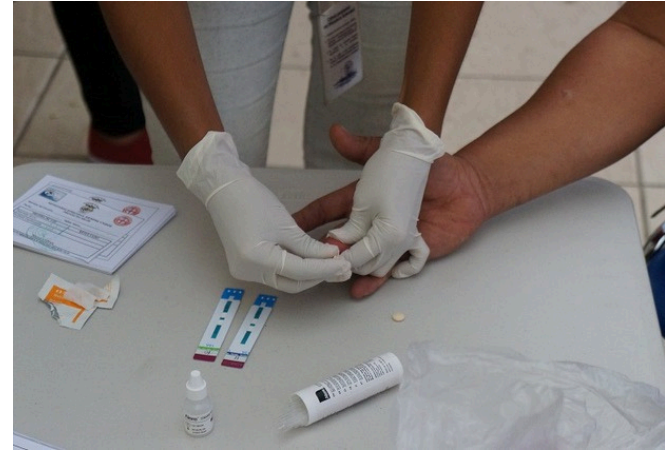
Continued community outreach and testing

As economic, political and security conditions further deteriorate in Honduras, our staff is working with our poorest HIV+ patients - one by one - to identify opportunities and enable them to develop skills to support themselves economically.