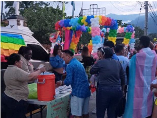
Siempre Unidos team members providing water and snacks during the Gay Pride march

Siempre Unidos has always played an important role in advocating for the rights of the LGBTQI+ population, who make up 25% of our patients.