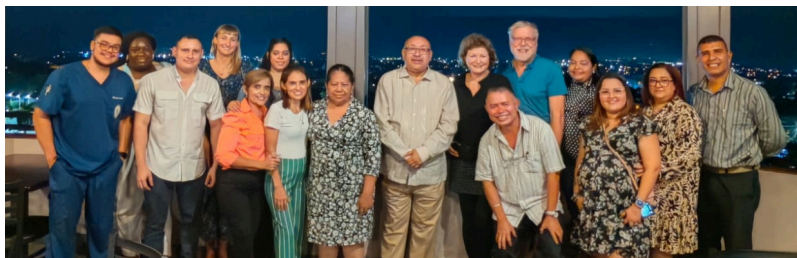
Hosting, celebrating and reconnecting with the Siempre Unidos team

In September 2024, we returned to Honduras to celebrate our 25th year of service with our dedicated staff and patients. The commitment of our staff members is reflected in the well-being of our HIV+ patients; an amazing 97% of whom now have undetectable viral loads.