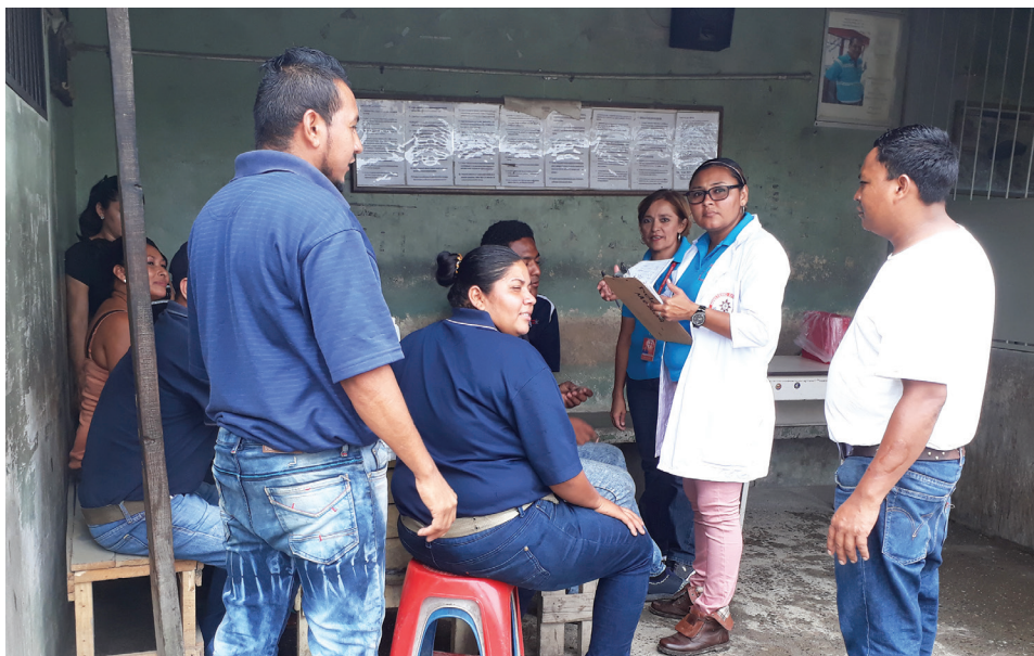
Bus drivers line up to receive HIV testing and counseling, a program supported by Gilead.

Testing is the crucial first step to end AIDS. When a person is negative and learns his/her status, that individual can take steps to prevent transmission. When a person is positive, we can ensure high-quality treatment and thus reduce the likelihood of that individual infecting another.