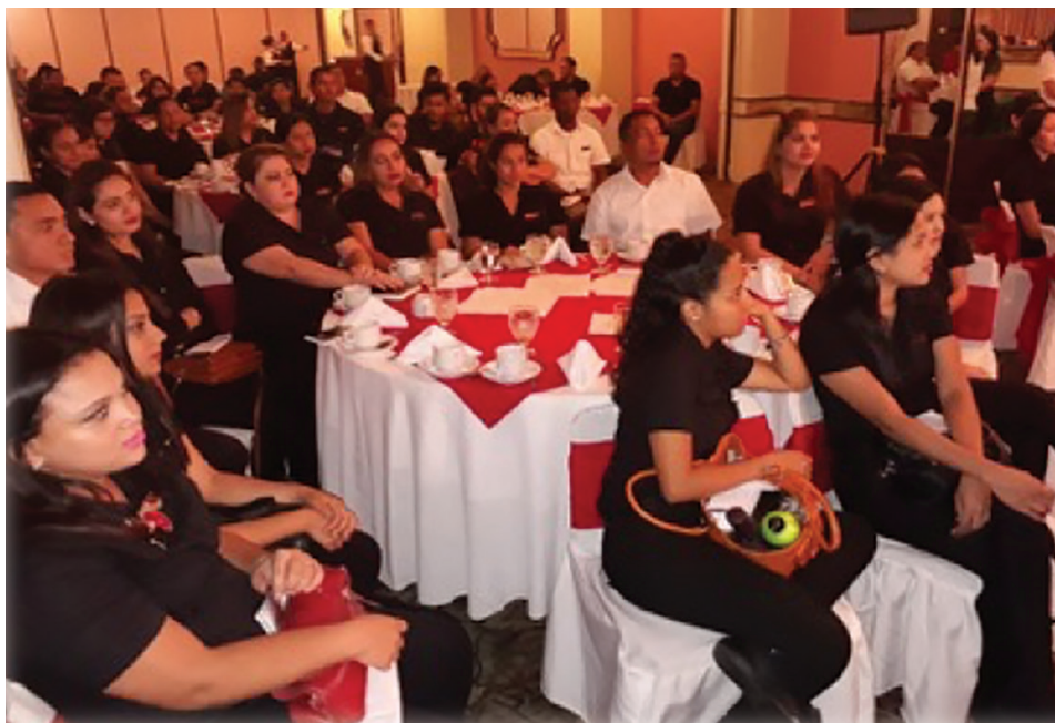
Luz’ employees at Siempre Unidos HIV training.

Siempre Unidos organizes many different activities to advocate for the rights of people living with HIV – marches through the city center, pro bono legal representation, and educational workshops. Pascual and the staff are always on the look-out for more such opportunities.