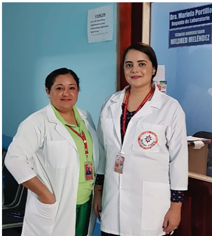
Siempre Unidos lab technicians stand outside the expanded laboratory.

Overall, our two clinics treated 464 HIV-positive patients (191 women and 273 men), ensured monthly nutritional support to 50 impoverished HIV-positive patients, received over 1,700 patient visits for primary care, held 456 counseling sessions and 24 support group meetings and served over 4,600 breakfasts and lunches.