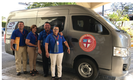
Home visit and education van transports staff to community health fairs and patient homes for checkups.

Two years ago, we launched our three-year 90-90-90 Campaign to help stop new HIV infections among high-risk groups and people living on less than $2/day. We aligned our campaign with the United Nations global framework to test 90% of people for HIV, treat 90% of infected individuals with antiretroviral medications, and achieve low viral loads in 90% of those treated.