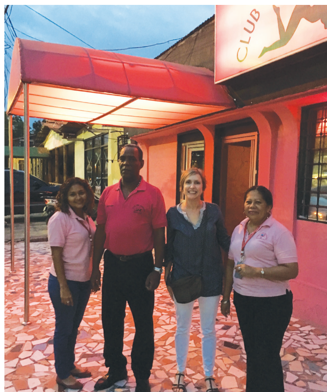
Outreach staff, club manager and the U.S. Executive Director visit a dance club to educate about condom use and HIV.

Siempre Unidos seeks to ensure that all people, especially those who are most vulnerable in society, are able to access information, defend their rights and have their voices heard. To this end, we organized 3 “Solidarity Marches” and 9 workshops on gender equity, gender-based violence, human rights and reproductive health reaching over 250 housewives, soldiers, commercial sex workers, male and female prisoners and members of the LGBT community.