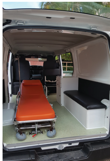
Mobile health van transports sick patients to our clinics and government hospitals and serves as a private site for HIV testing and counseling.

http://www.siempreunidos.org/donate/90-90-90-campaign/