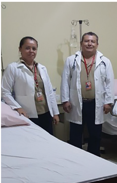
Our San Pedro Sula nurse and physician prepare the recovery room for patients.

In February 2003, Siempre Unidos established one of the first three Honduran HIV treatment clinics. Since then, we continue to innovate to meet the medical and psycho-social needs of our patients at our two clinics in the cities of San Pedro Sula (population 1 million) and Siguatepeque (pop. 80,000).