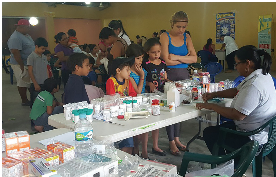
Clinic pharmacy manager fills prescriptions for patients attending a health fair.

Siempre Unidos continues to expand its services beyond clinic walls with community-based health fairs delivering primary care like well-baby check-ups and blood pressure monitoring and HIV and hepatitis B education and testing. Over 2,500 people attended our 29 health fairs in 2016 held in high poverty neighborhoods and central parks and open markets. Twenty-five percent were tested for HIV; of these 14 people (2%) were HIV positive. Two of 643 people screened for hepatitis B received positive results (0.3%). Everyone was enrolled in treatment. Given the majority tested were adults living in high poverty neighborhoods, slums and villages, we will increase our screening in these areas in the coming year.